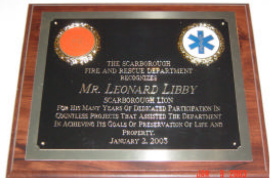
Plaque from the fire and rescue departments.