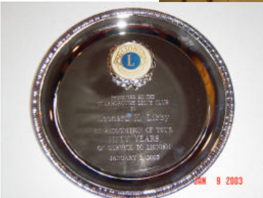
Silver Platter presented by the club.