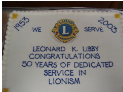
Cake presented to Len by Boy Scout Troop #39